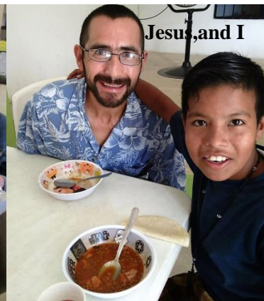
Jesus, and I