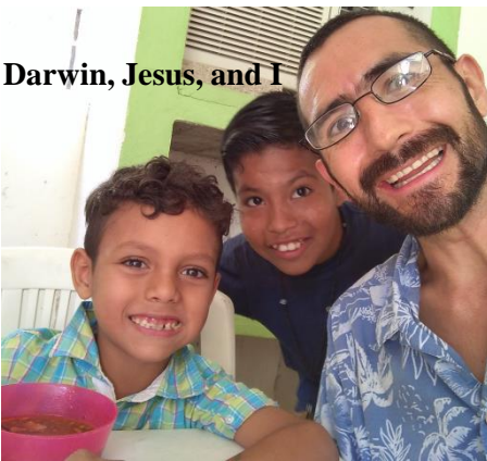
Darwin, Jesus, and I